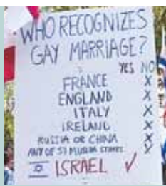
Support for Israel at the 2010 Toronto Gay Pride parade

The participation of Queers against Israeli apartheid (Quaia) in the Toronto Gay Pride parade continues to be contentious as Pride Toronto flip-flopped on its decision to ban and then allow the group to march in the 2010 parade. Subsequent to the constant pressure FSWC maintained on both Pride and city politicians, a near unanimous decision was taken by Toronto City Council to fund future Pride parades only after the parade is held and anti-discrimination policies are clearly followed. FSWC plans to meet with newly elected Mayor Rob Ford prior to the 2011 parade to ensure that taxpayer funded Israel-bashing will no longer be tolerated.