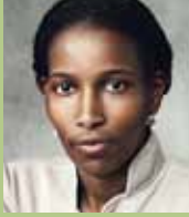
Ayaan Hirsi Ali