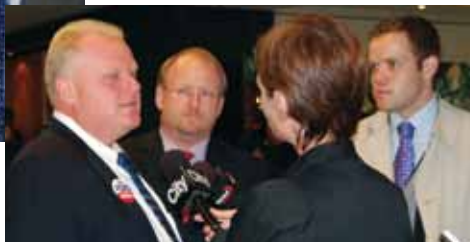
The media interviewing Rob Ford at the Mayor's Luncheon

his determination to ensure hatred has no place in events such as the Toronto Gay Pride parade. When asked about taxpayer support for anti-Israel marchers in future Gay Pride parades, the Mayor was clear. "This is very