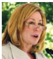
Linda Frum, Senator "We take for granted the idea that the freedom we enjoy is permanent."